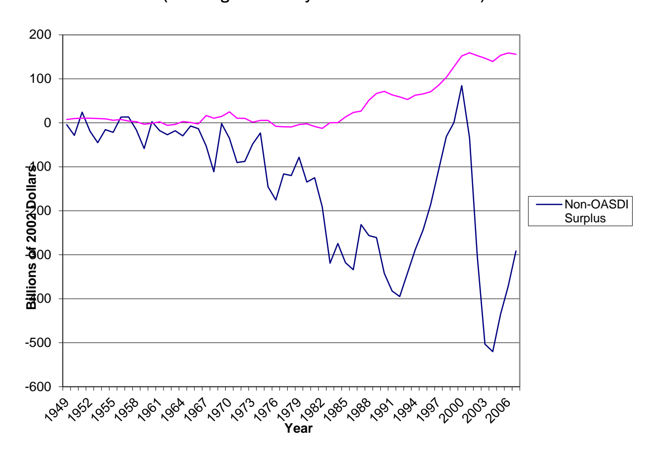
Figure 1 Social Security and Non-Social-Security Deficit or Surplus (Including Interest Payments to the Trust Funds)